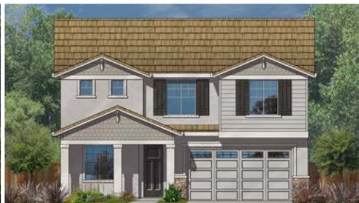
Elevation B - Craftsman