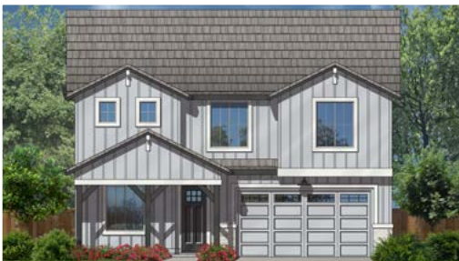
Elevation A - Farmhouse