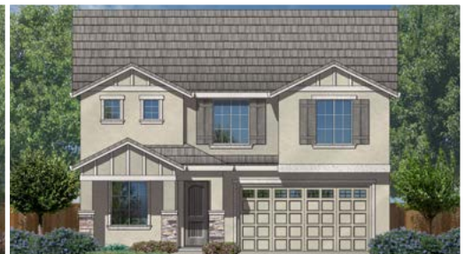
Elevation C - French