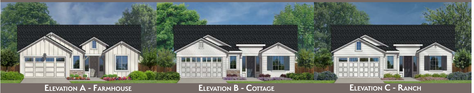
ELEVATION A - FARMHOUSE