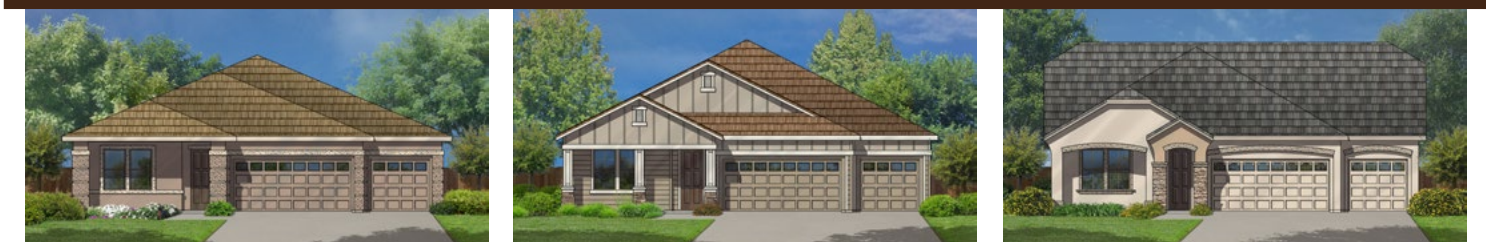
ELEVATION A - PRAIRIE