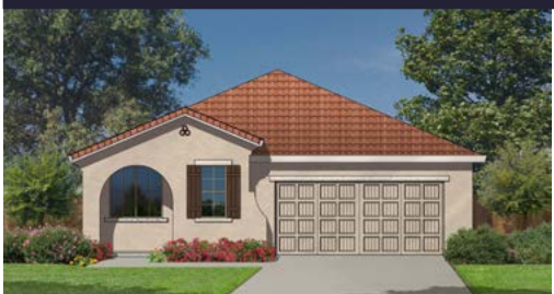
ELEVATION A - MISSION