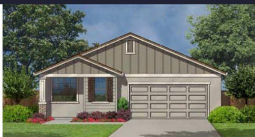
ELEVATION B - CRAFTSMAN