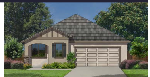
ELEVATION C - FRENCH VILLA