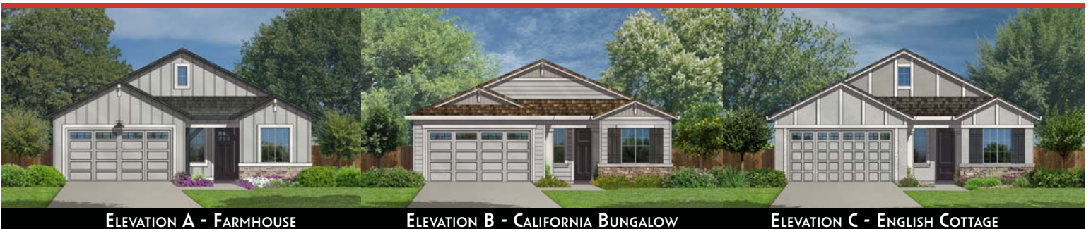
ELEVATION A - FARMHOUSE