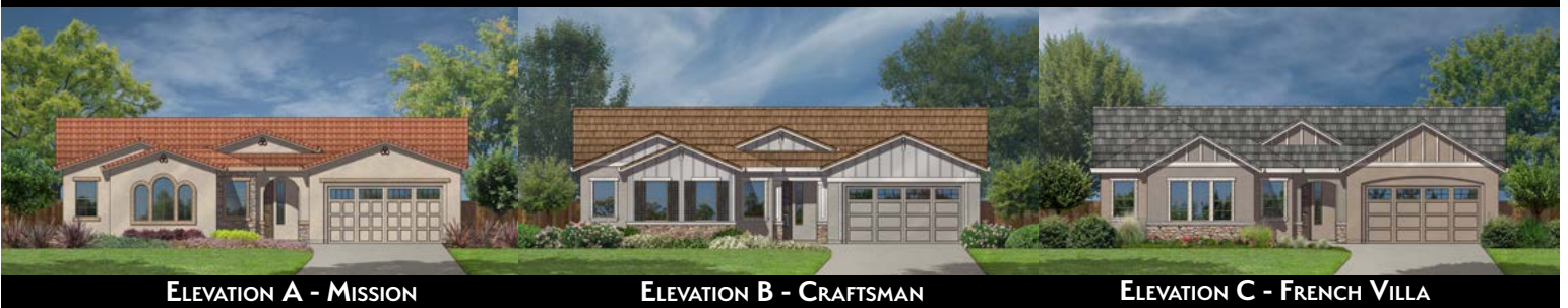
ELEVATION A - MISSION